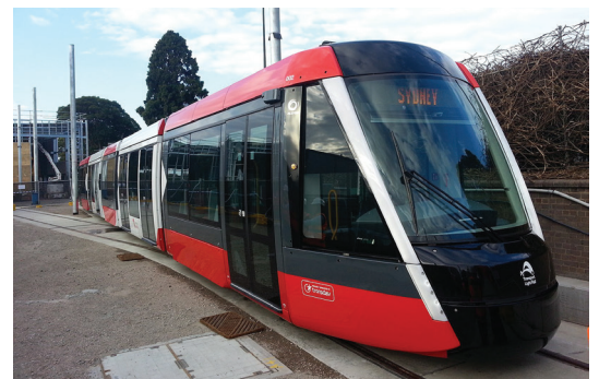
EXTERIOR OF THE ALSTOM CITADIS X05 TRAMS TO BE USED ON THE CBD AND SOUTH EAST LIGHT RAIL