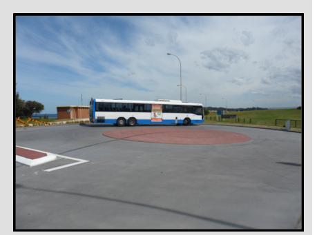
The new turning circle