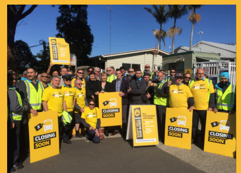
BUS DRIVERS AND MAINTENANCE WORKERS RISE UP AGAINST BUS PRIVATISATION AT KINGSGROVE BUS DEPOT ON JULY 27